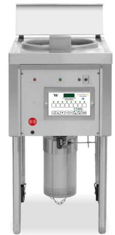
OF49C & OF59C Collectramatic® Open Fryer 8-Channel Programmable Controls

Installation Requirements Ventilation required. Check local codes.